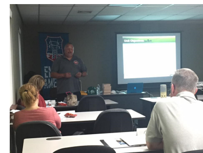
CERT Basic Training—September 2016