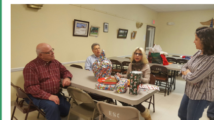
Christmas Wrapping Party—December 2016